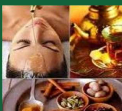
ALL AYURVEDA MEDICINES AVAILABLE AT OUR PHARMACY